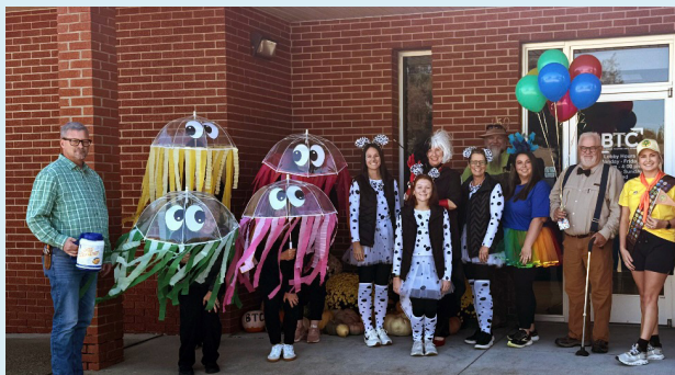
Happy Halloween from BTC!