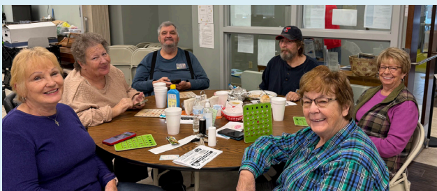
Bingo at the Ballard County Senior Center